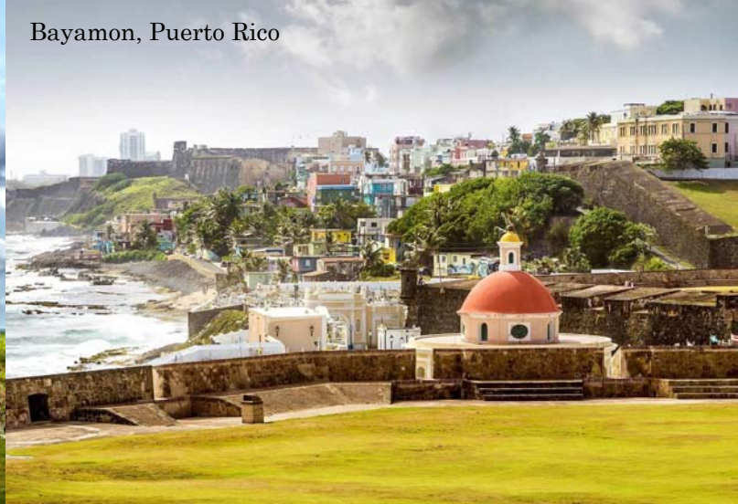
Bayamon, Puerto Rico