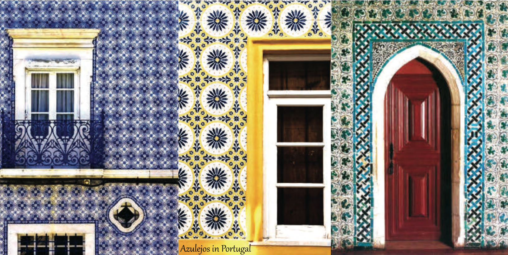
Azulejos in Portugal

issue No. 2: Spring 2016 | in this issue: